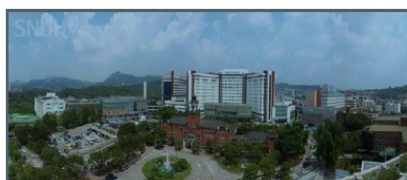
Seoul National University Hospital has been a long-term partner of Sanofi R&D, supporting important portfolios such as PCSK9, Lixisenatide and Sarilumab.

SEOUL NATIONAL UNIVERSITY HOSPITAL CLINICAL TRIALS CENTER – SEOUL - KOREA